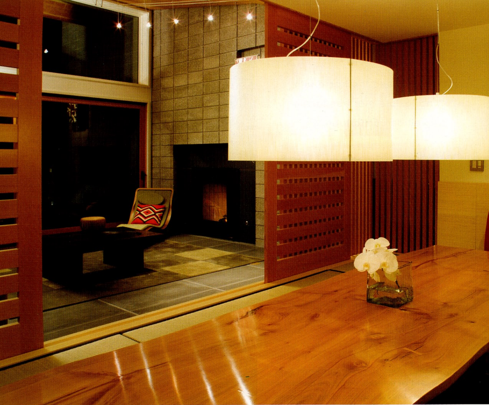
Above: The tatami room, with a sunken table and built in benches is a private dining area that is a whimsical ode to Paul's time spent in Japan. Below: The slider doors off the living room open onto a covered deck overlooking the pool area.

comfortable furniture in the living room.